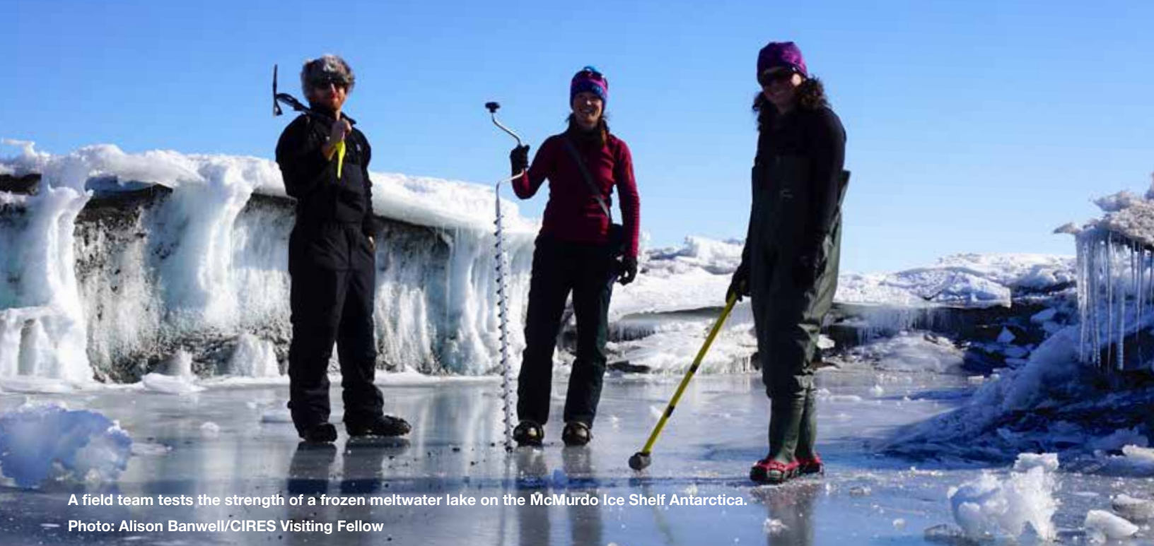
A field team tests the strength of a frozen meltwater lake on the McMurdo Ice Shelf Antarctica.