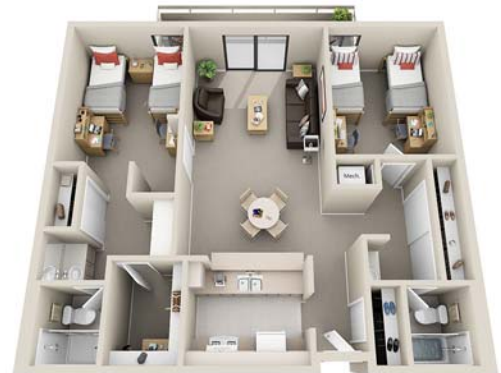
TROY HALL TYPICAL 2 BEDROOM APT PLAN

TRH 1 Bedroom / 2 Person: $4,980 per person, per semester 1 Bedroom / 3 Person: $3,680 per person, per semester 2 Bedroom / 4 Person: $4,795 per person, per semester 2 Bedroom / 5 Person: Double room: $4,485 per person, per semester Triple room: $3,070 per person, per semester