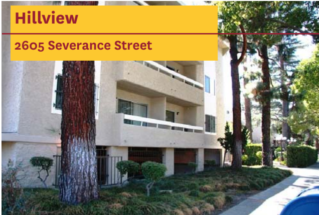
Hillview 2605 Severance Street

* Information, including rents, is accurate as of the time of publication. The availability of listed housing accommodations and programs are subject to change based on local health authority restrictions and guidelines.