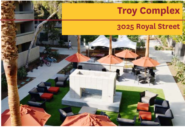
Troy Complex 3025 Royal Street