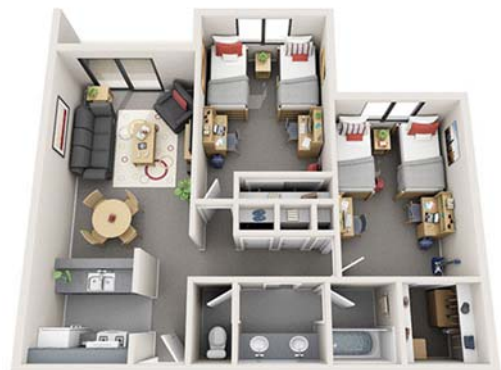
TROY EAST and HILLVIEW TYPICAL 2 BEDROOM APT PLAN