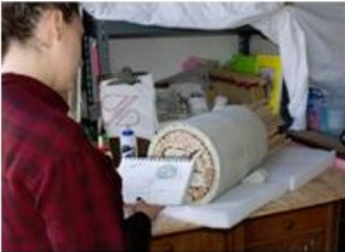
Civil & Environmental Engineering