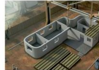
Industrial & Systems Engineering