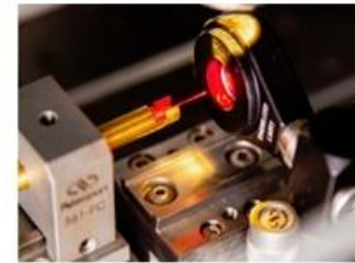
Chemical & Petroleum Engineering and Materials Science