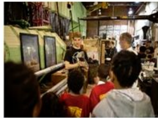
Aerospace & Mechanical Engineering