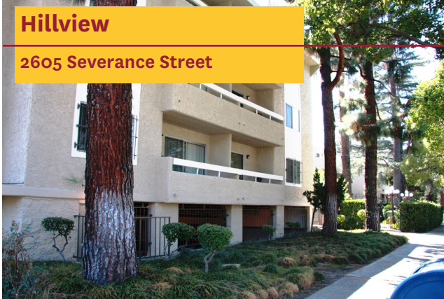
Hillview 2605 Severance Street