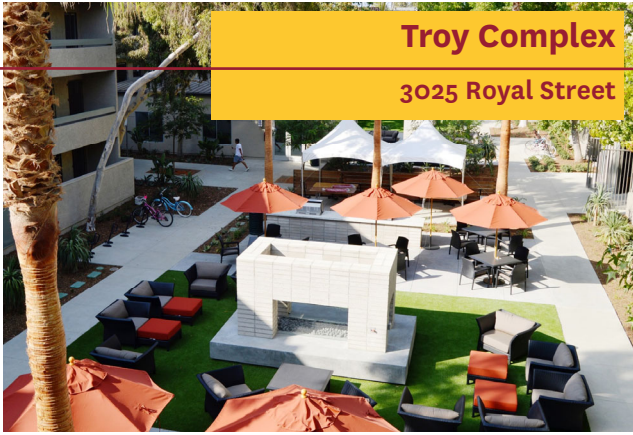
Troy Complex 3025 Royal Street