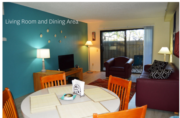
Living Room and Dining Area