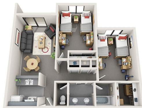
TROY EAST and HILLVIEW TYPICAL 2 BEDROOM APT PLAN

The two bedroom apartments in Hillview (HIL) are spacious, feature independently air-conditioned bedrooms and living rooms ceiling fans, and dual-pane windows. Many of the units have balconies.