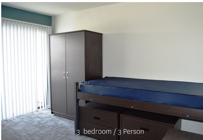
3 bedroom / 3 Person

* Information, including rents, is accurate as of the time of publication. The availability of listed housing accommodations and programs are subject to change based on local health authority restrictions and guidelines.