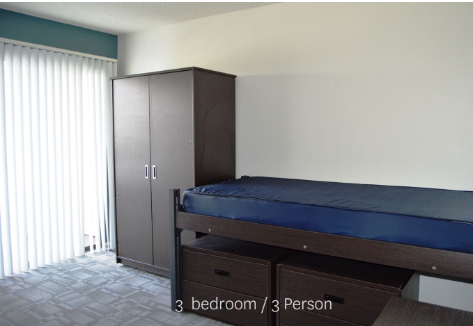
3 bedroom / 3 Person

A large three story apartment building with a ground-floor garage, Sierra has a lounge and a spacious patio for residents’ relaxation. It is home to the area’s Customer Service Center.