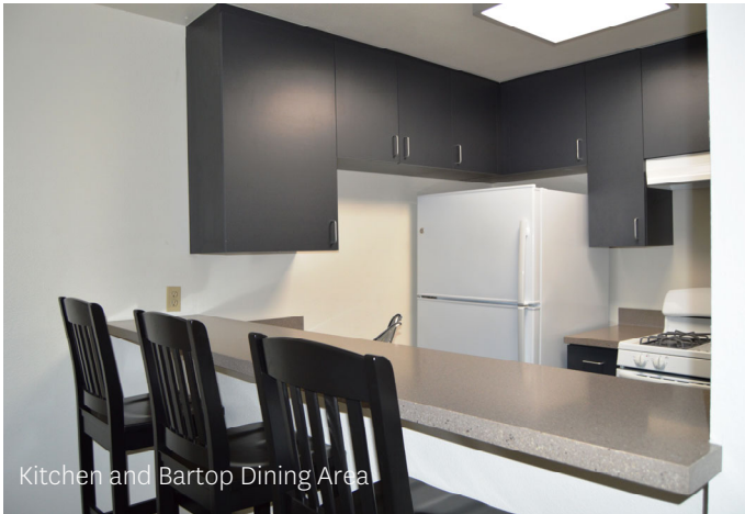
Kitchen and Bartop Dining Area