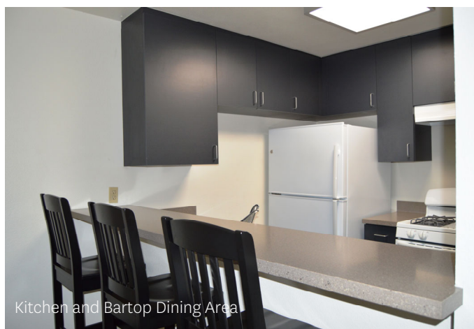
Kitchen and Bartop Dining Area