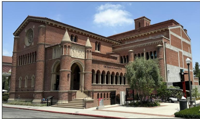
Opened in March 2024, the state-of-the-art, nearly 40,000-square-foot Dramatic Arts Building is a revival and renovation of the historic five-story building at the corner of Jefferson Boulevard and Hoover Street. The facility provides a space where students, faculty and staff can come together to cultivate the next generation of diverse storytellers.